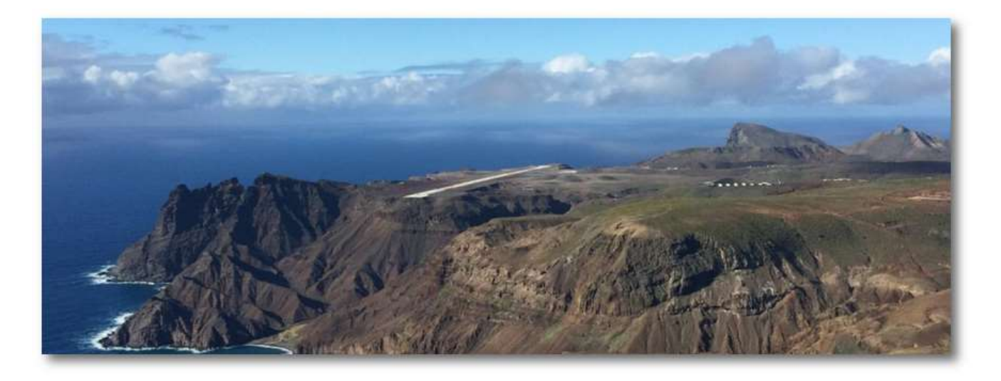
St. Helena, Ascension and Tristan da Cunha Philatelic Society